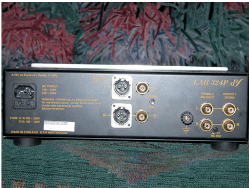
Rear view of the E.A.R. 324; inputs are to the right (Phono 1 for MC/MM is far

The E.A.R. 324 phono amp is a solid-state device weighing in at a hefty 11 pounds, and measuring 12.75" wide x 4.25" high x 10.5" deep. There are two RCA inputs, one dedicated to MM, the other switchable for MM or MC. Two outputs are provided, one for unbalanced, the other for balanced.