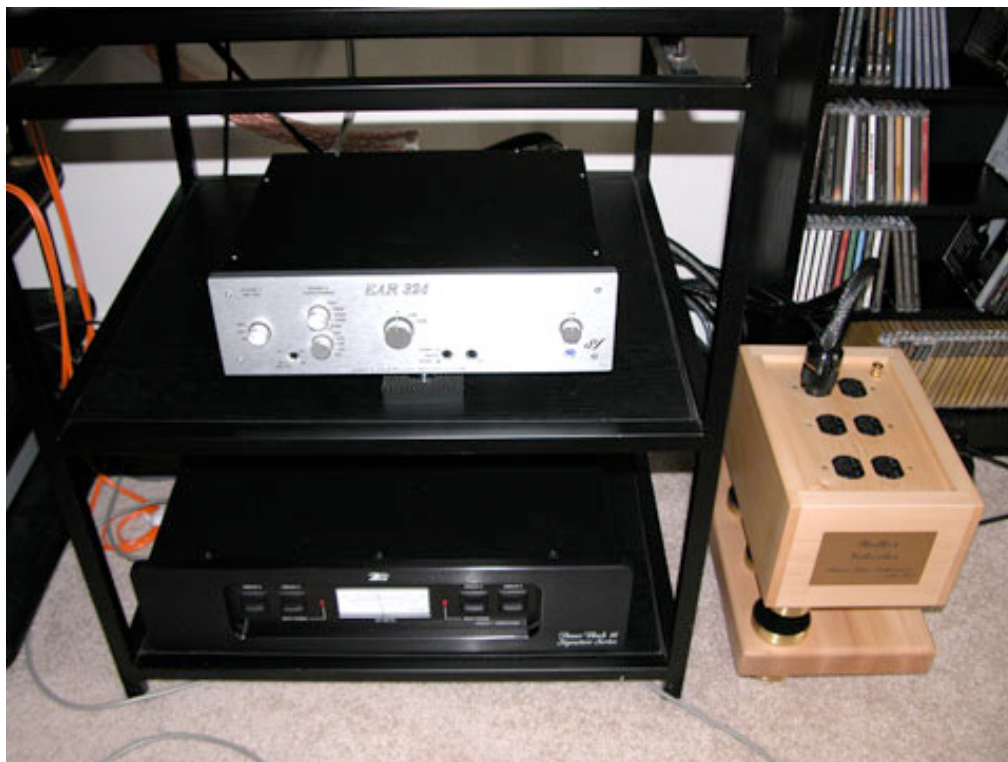
The E.A.R. 324 phono amp plugged into the Walker Audio Velocitor (the light brown Maple unit to the right) via Silent Source power cabling